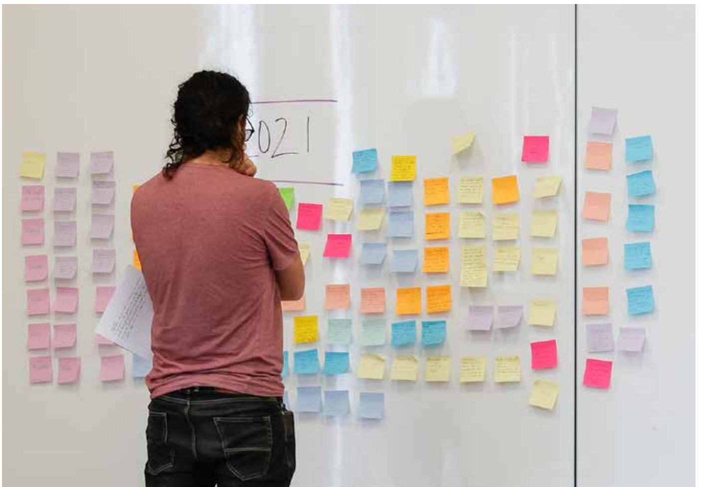
Stories from the Future - Tasmanian Workshop 2021 - Diversity Arts x Moonah Arts Centre