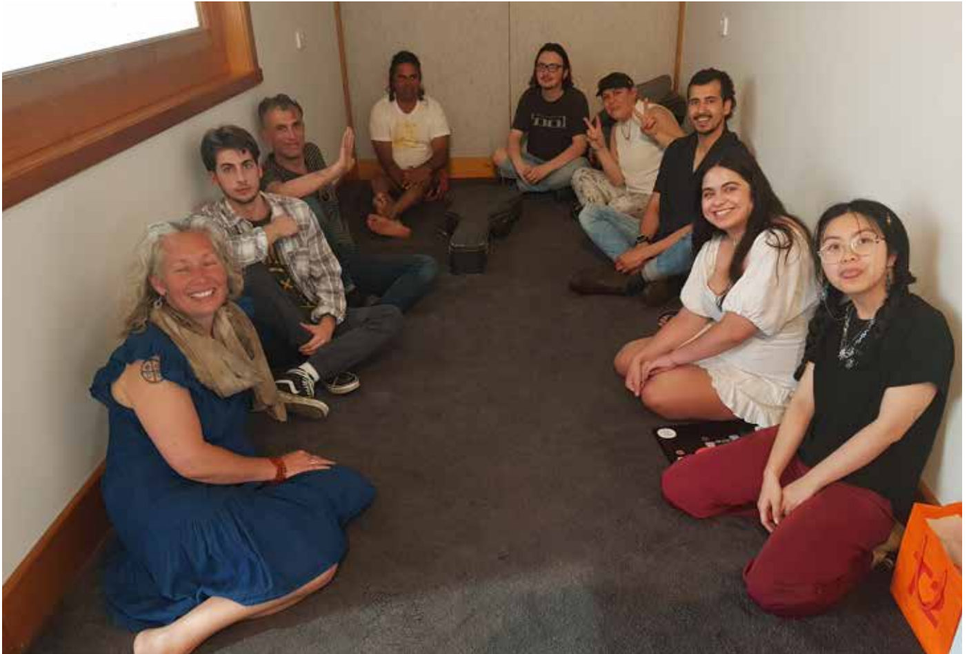
Stories from the Future - Tasmanian Workshop 2021 - Diversity Arts x Nayri Niara - Image credit: Fenella Edwards