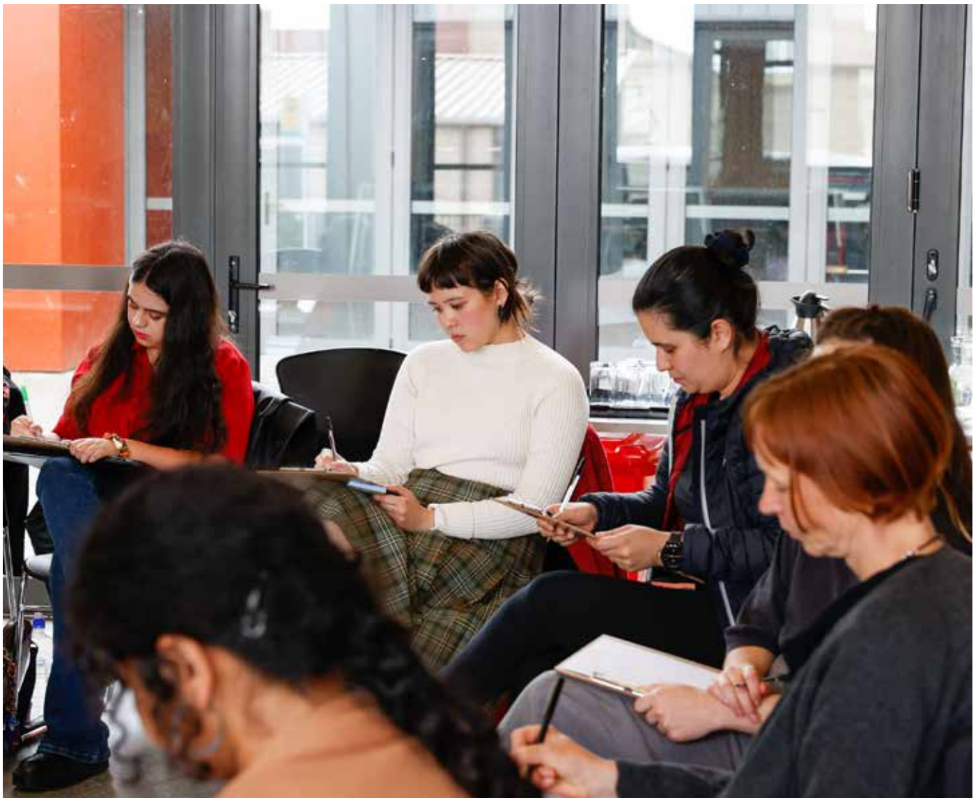
Stories from the Future - Tasmanian Workshop 2021 - Diversity Arts x Moonah Arts Centre

We provided advice and consultation to a broad range of government agencies, organisations and companies, including the ABC, Ensemble Theatre, Sydney Opera House, Screen QLD, Screen Australia and many more.