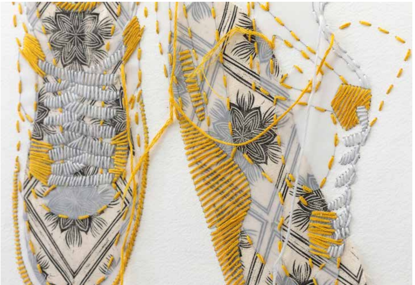
Artwork by Jocelin Meredith, I'm Australian too, I Am Not A Virus Australia project, 2020/21

As part of our ongoing advocacy in the creative sector, we continued to facilitate and resource this national network. The Roundtable sessions aimed to facilitate coordinated, cohesive and cogent approaches, leading practices and models that contribute to systemic change. In 2021, due to COVID lockdowns and stresses, we could only hold two meetings.