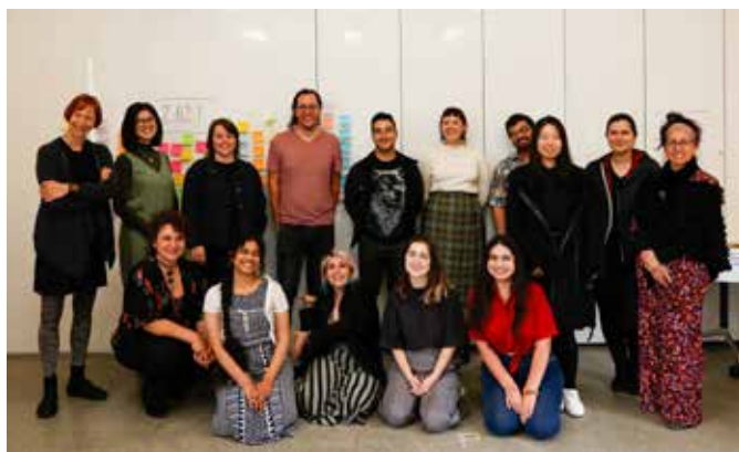
Participants from Tasmania/Lutruwita

Partnership with Nayri Niara, Moonah Arts Centre, Tasmania Performs and Multicultural Youth Tasmania.