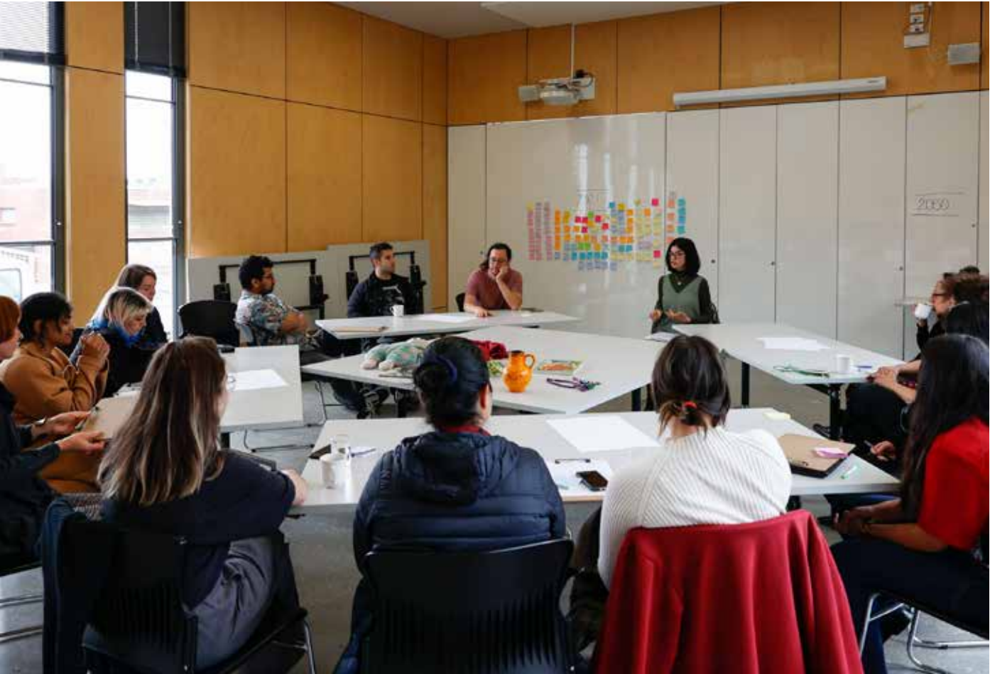
Stories from the Future - Tasmanian Workshop 2021 - Diversity Arts x Moonah Arts Centre - Image credit: Yuko Masuda Kim