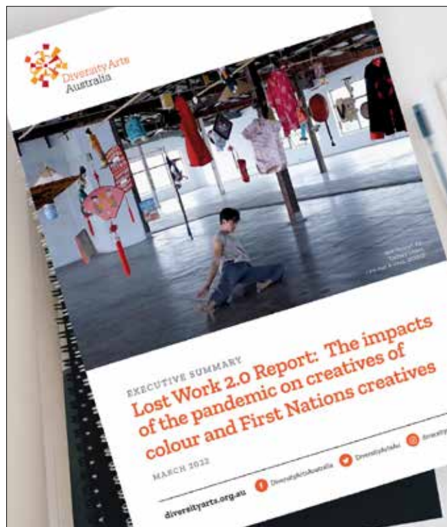
Lost Work 2.0 Report

“The results of Report 2.0 indicate there is an urgent need for support and investment in First Nations and culturally diverse artists, filmmakers and arts workers at this time. Our previous research already tells us that there was a significant underrepresentation of culturally diverse artists before the pandemic, and this has been further exacerbated over the past two years.”