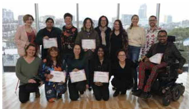
Graduating interns from the Disability and Culturally Diverse Internship program!