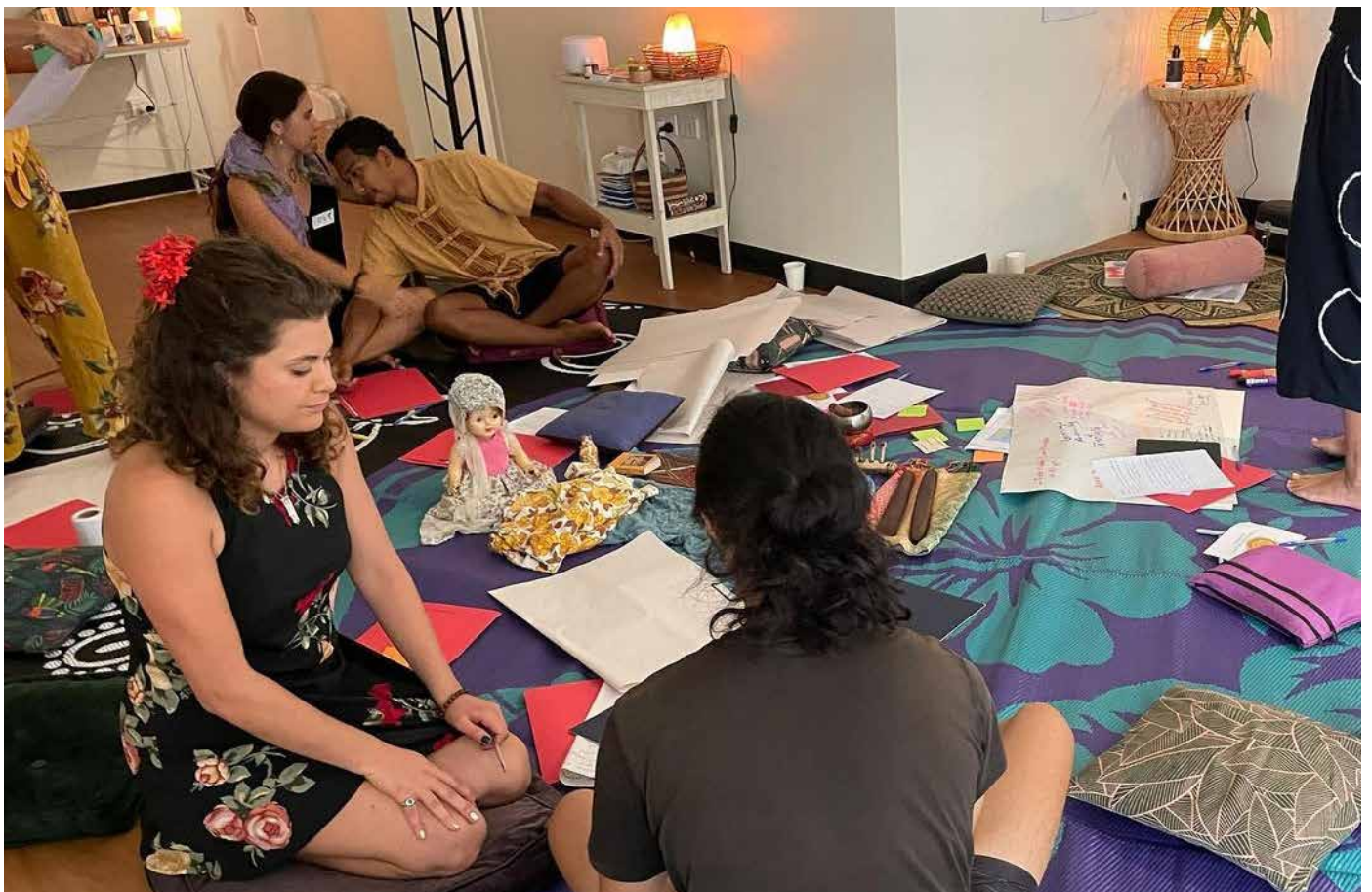
Stories from the Future - Northern Territory Workshop 2021 - Diversity Arts x Darwin Community Arts