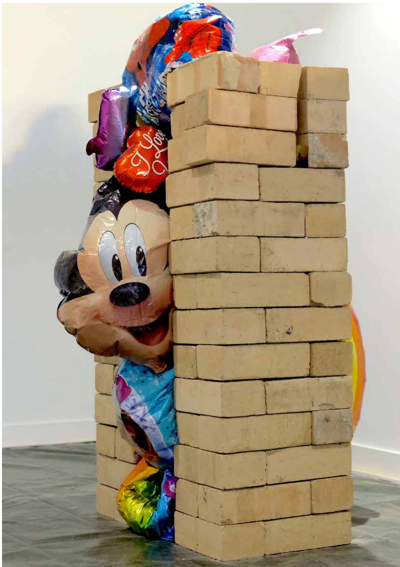
Artwork by Yunyang Cen, Excuse me, where am I? I Am Not A Virus Australia project, 2020/21