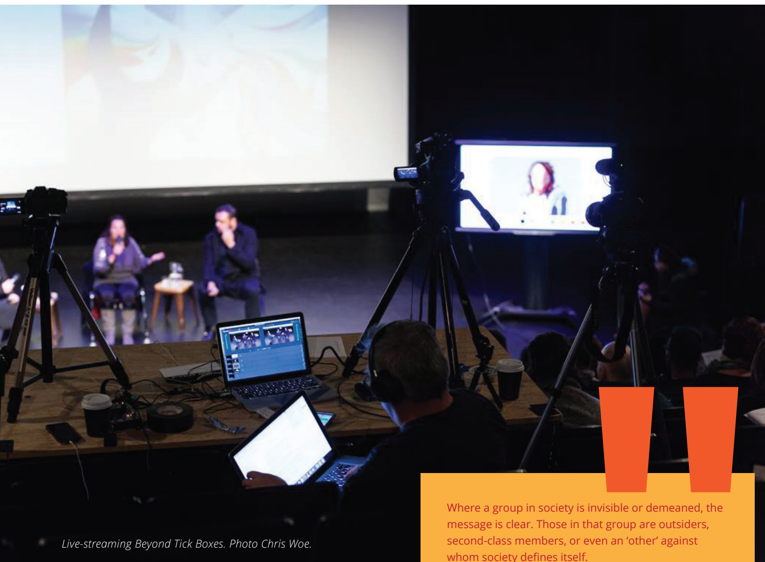
Live-streaming Beyond Tick Boxes.