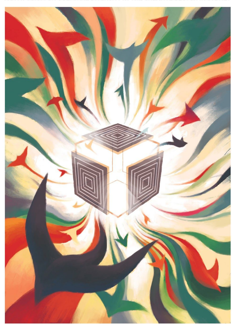
Casula Powerhouse Arts Centre, 1 Powerhouse Rd, Casula Thursday 29 June • 9am - 6pm

A SYMPOSIUM ON CULTURAL DIVERSITY IN THE CREATIVE SECTOR IN SYDNEY